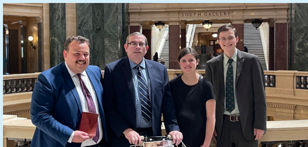
Our Church Ambassador Network Team