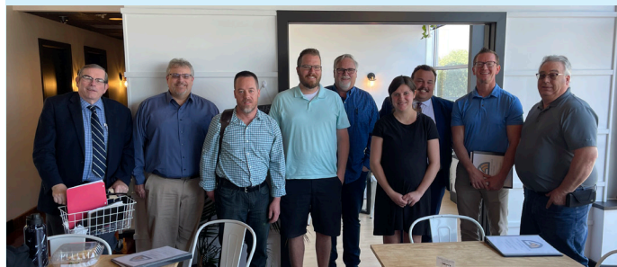
Our biannual Pastoral Advisory Committee Meeting

Difference-making partners make CAN possible. When we visit legislative offices, in a real sense you are going there too, as a valued partner. Thank you for investing.